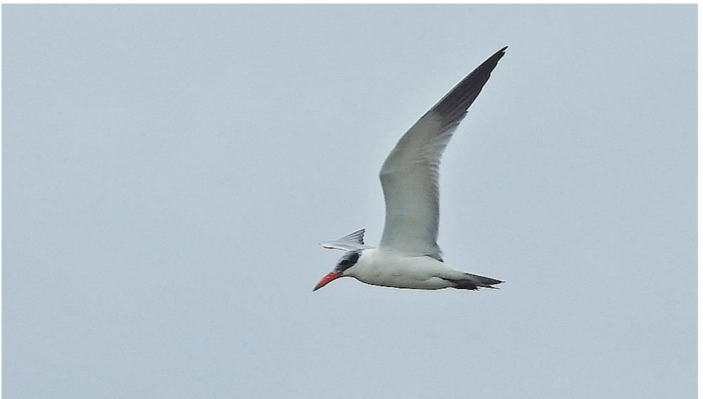
Caspian Tern - © Matt Plenty