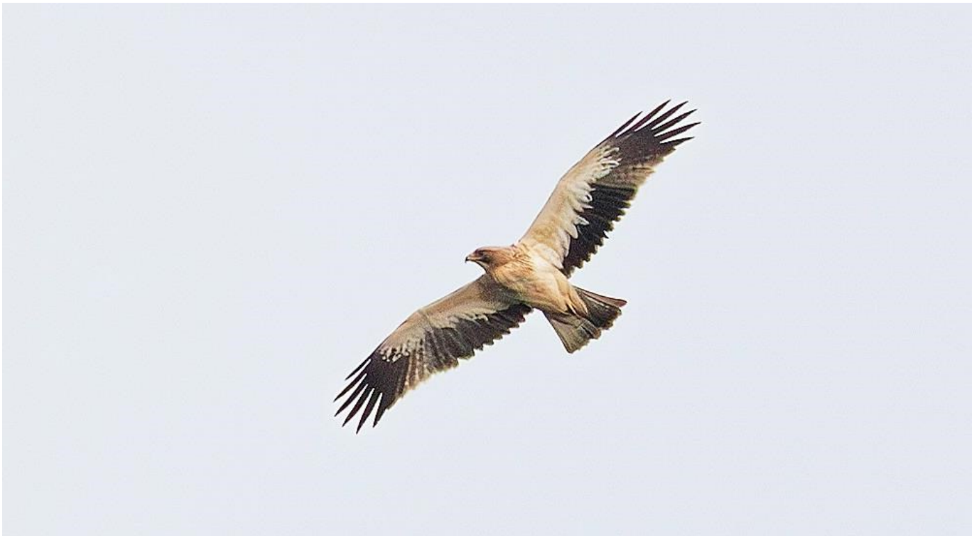
Booted Eagle