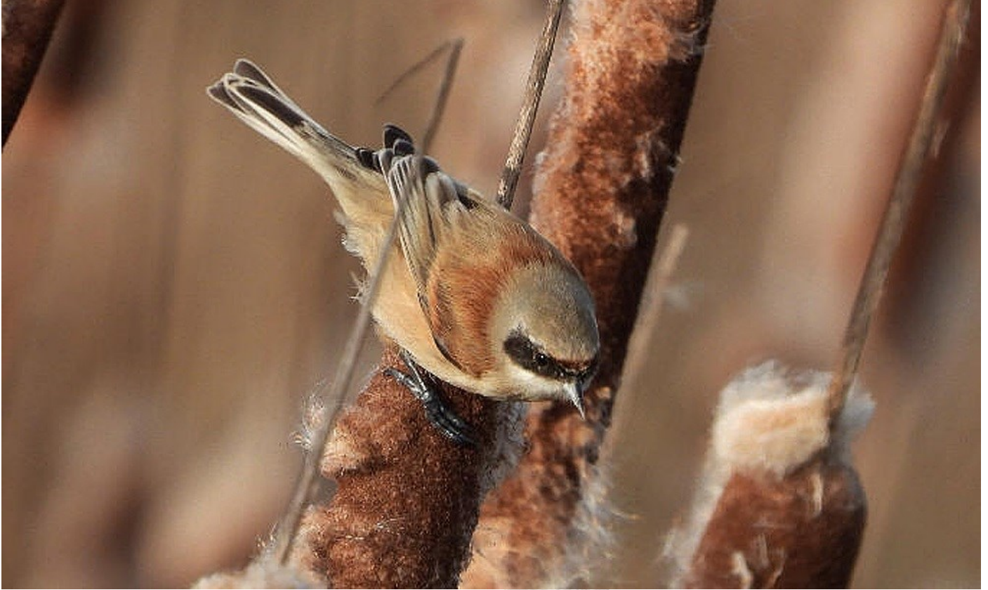
Penduline Tit on Aust Wetland