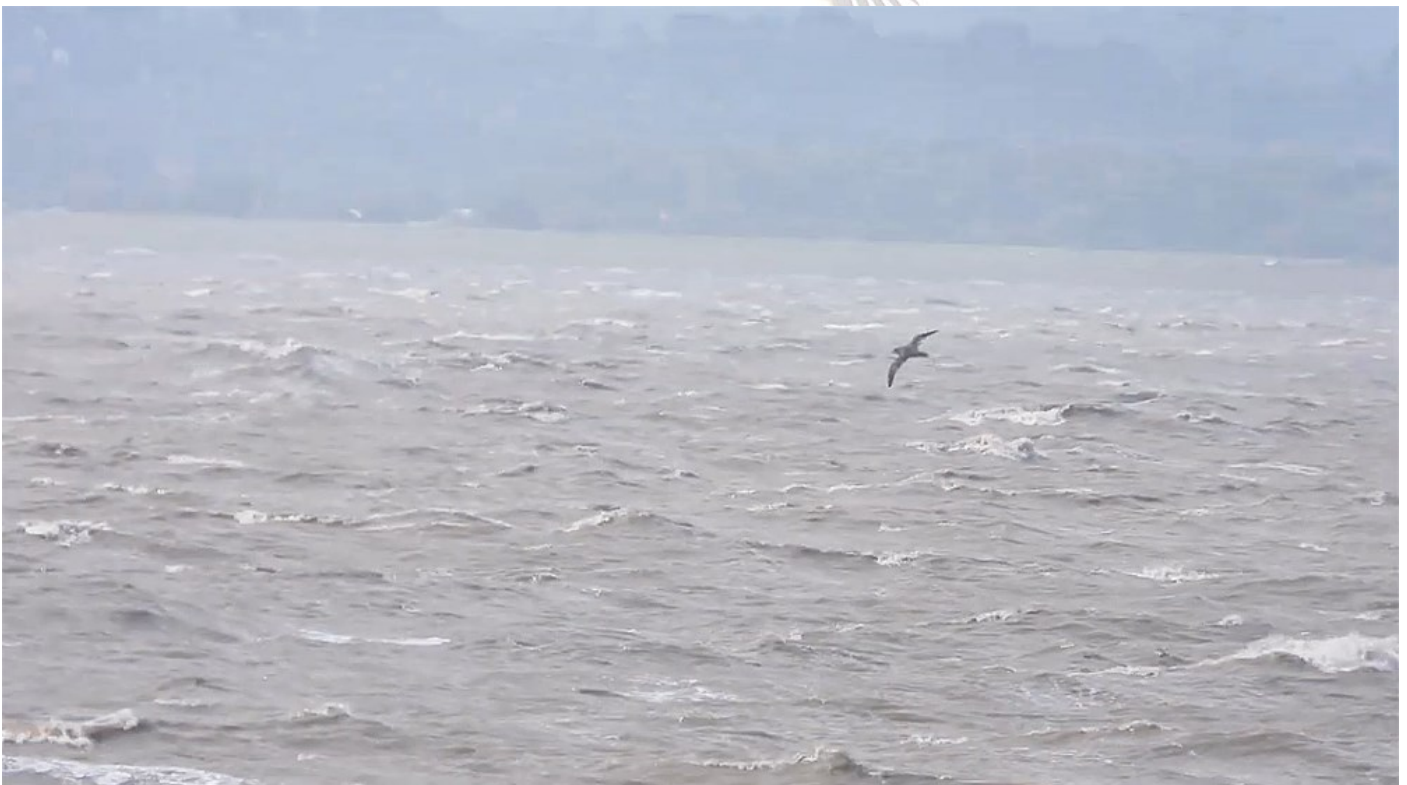
Sooty Shearwater from Severn Beach – Paul Bowerman